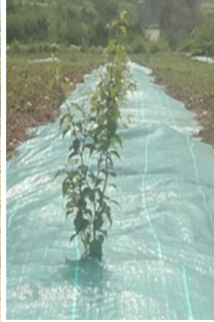
Luxuriant growth of in-situ seedlings of wild peach and apricot after 4-months