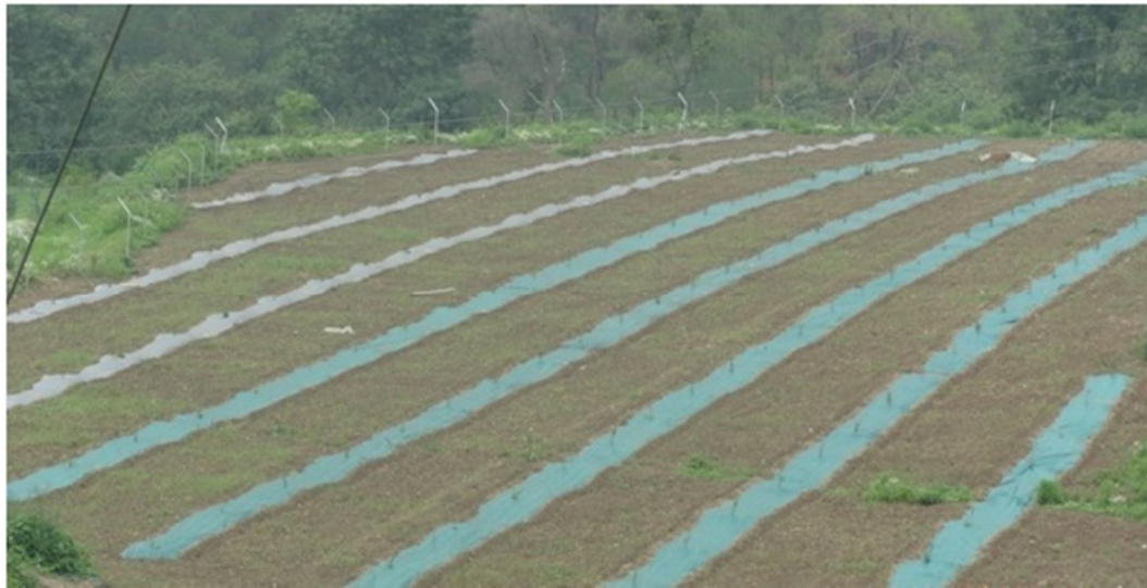
In-situ moisture conservation using inorganic mulching materials (Showing distant view of solar power fencing around 1715 m periphery of orchard)