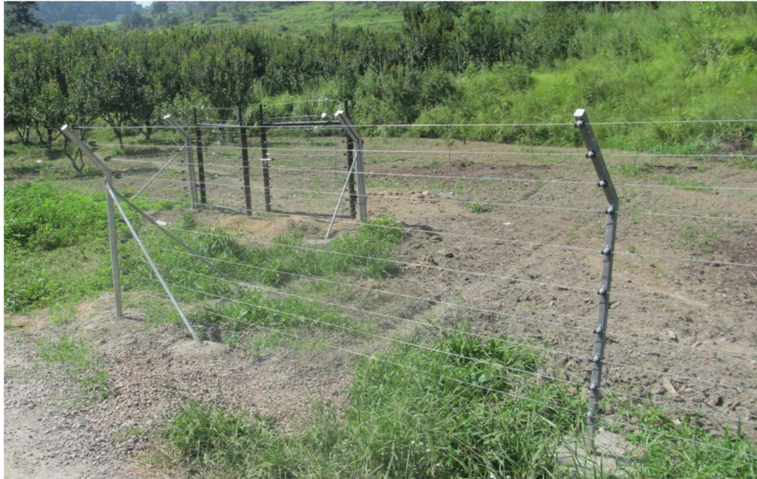
Solar power fencing highly effective to evade monkeys' and stray animals' menaces