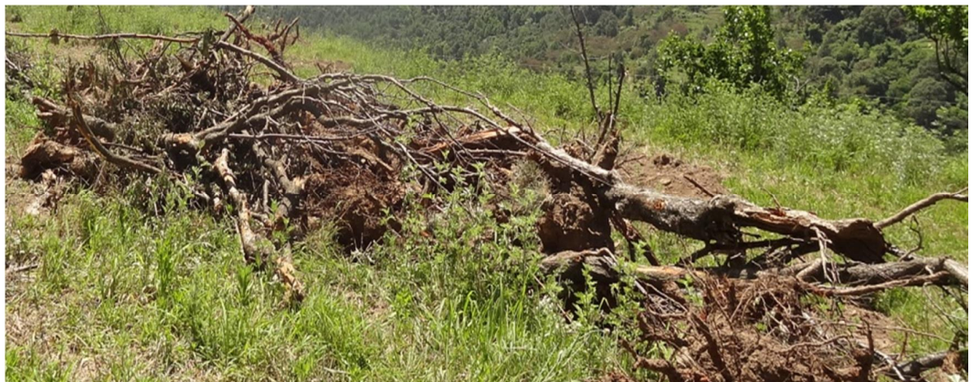
Uprooting of old declining plants of plum at Nando block