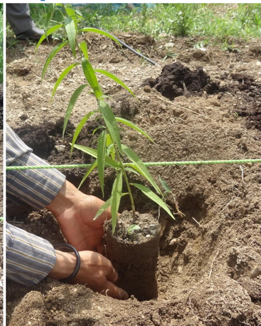
Transplanting of poly bag raised insitu seedlings of wild apricot and wild peach in the field