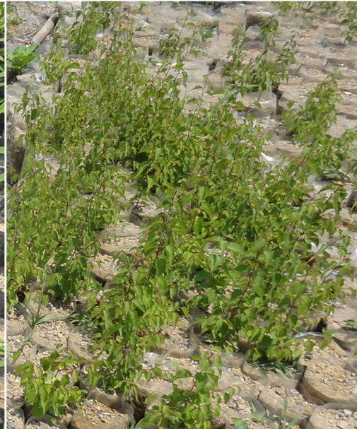
Raising in-situ seedlings of wild Peach