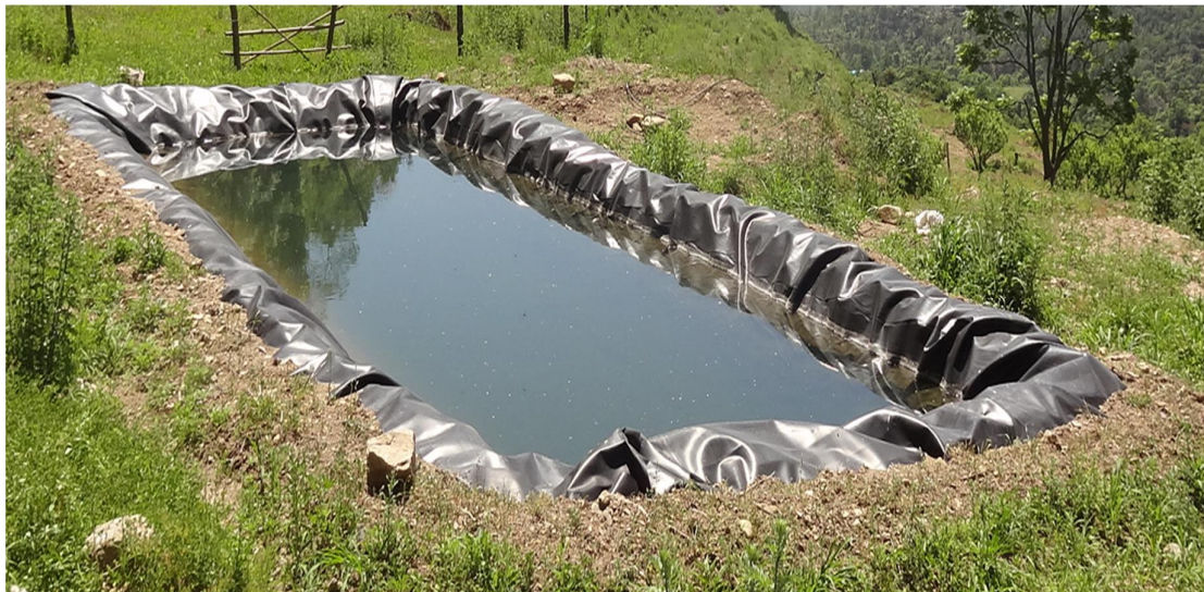
Cost effective “Geomembrane Polyline” (1000GSM) Water Storage Tank of 100000 Liters Capacity (₹ 0.70/liter)